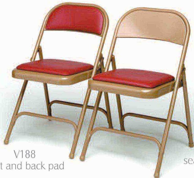
V188 seat and back pad