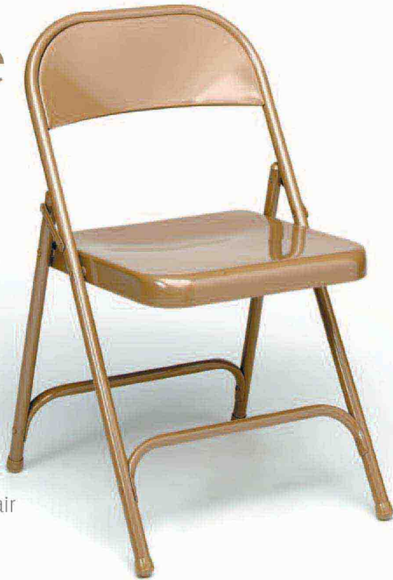
V162 folding chair