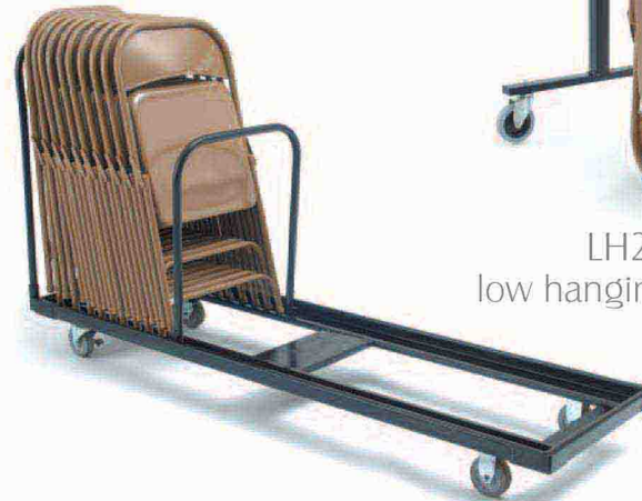
LH24 low hanging trolley